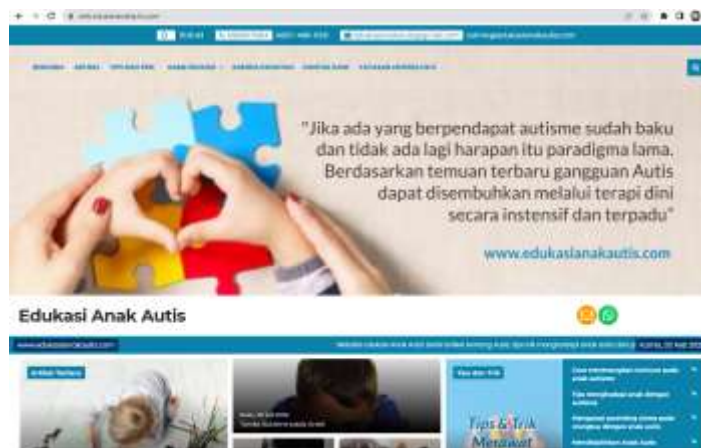
Figure 4. Display of the Website Home Page