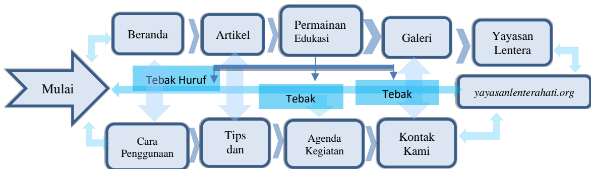
Figure 3. Website Structure Flowchart

The domain is a unique name to identify the name of a computer server, such as a web server or email server on the internet. The domain is also called the address that needs to be inputted to access a website. The web design is a Top Level Domain (TLD) with a .com extension, www.edukasianakautis.com . This domain name was chosen as one of the development objectives: to educate autistic children through the media website. The structure of the educationanakautis.com website can be seen in Figure 3 as a diagram below.