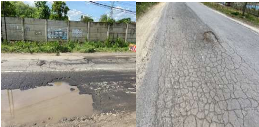
Figure 3. Alligator Skin Cracking And Subsidence

In Figure 2. It can be seen that the highest percentage of damage to alligator skin cracks is 31% and the lowest percentage of damage to block cracks is 2%. In Table 1. are the types of damage, the extent of the damage and the quality of the damage broken down per segment. In Figure 3 is the documentation of the results of a survey on the types of damage to alligator skin cracks and collapse.