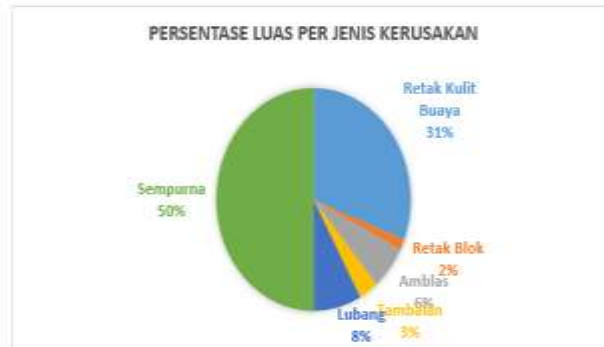
Figure 2. Area Percentage Per Damage Type

Visual survey results The types of road damage that commonly occur on Jalan Lembar-Sekotong-Pelangan are alligator skin cracks, block cracks, subsidence, patches, potholes, and loose grain. Percentage of area per type of road damage found in STA 0-200 (Segment One), STA 600-800 (Segment Two), STA 1600-1800 (Segment Three), STA 3600-3800 (Segment Four), STA 4600-4800 (Segment Five), STA 5000-5200 (Segment Six), STA 14600-14800 (Segment Seven), and STA 15400-15600 (Segment Eight) on the Lembar-Sekotong-Pelangan Road section in Figure 2.