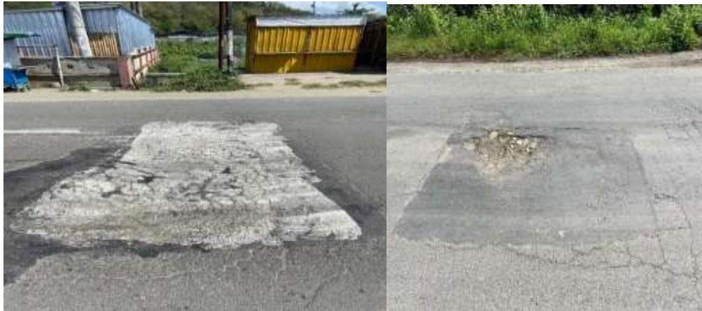
Figure 4. Patch Damage And Holes