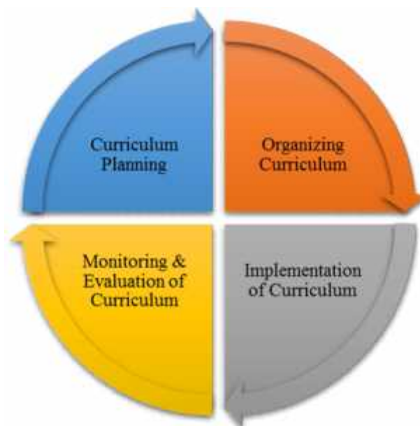
Figure 2: Curriculum Integration Management Cycle

Based on the accreditation data for the Roushon Fikr Islamic Elementary School with the achievement of an “A” accreditation rating in 2018 it shows that this school is in a very good category, this can be seen in the details of the acquisition of school accreditation instruments, namely; the content standard reached a value of 92, process standard 91, graduation standard 92, teaching staff standard 88, infrastructure standard 92, management standard 92, financing standard 89, assessment standard 92, with a total final score of 91. 28