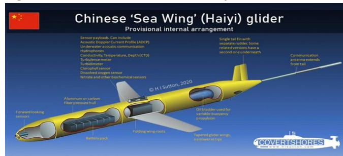
Figure 2. Specifications of Haiyi Made in China