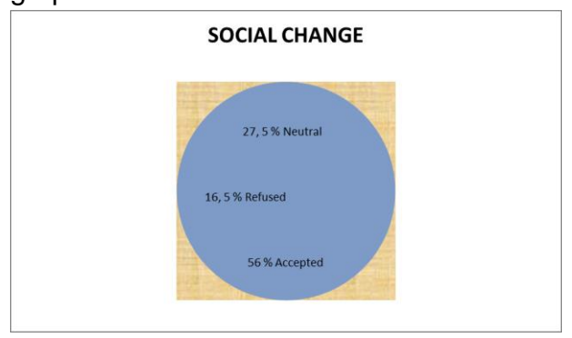
Figure 2. The Tendency of the Students towards Social Change

were applied or used to understand the role, namely, the patterns of their religious thought or their mind set, their beliefs on religio-culture, socio-cultural values. norms. behaviors and ethics or their The result of moral. questionnaire indicated that many students (n=102 / 56 %) tended to eccept the change, few of them (n=30 / 16.5 %) tended to refuse. and some of them (n=50 / 27,5 %) tended to be neutral as seen in the following graph.