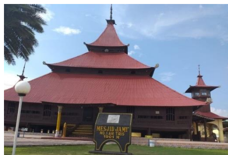
Figure 3. Jami' Mosque from the Front

Based on monitoring of the Jami' mosque in Air Tiris, it can in fact be used as a religious tourism destination. This can be seen from various aspects such as building aspects and other aspects. From the aspect of the building can be seen the following picture.