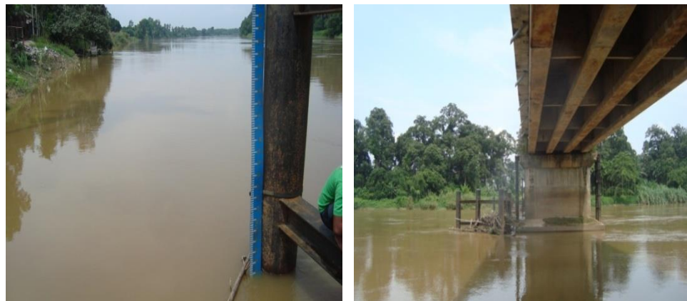
Figure 2. The river staff gauge station in Pekan Heran Bridge, Indragiri River

The applicability of ANFIS as a water level forecasting model is investigated. To illustrate the validity and capability of ANFIS method for time series forecasting and modeling, Indragiri River of Indragiri Hulu Residence is chosen. It has been operated for drinking water, domestic use and recreation facilities. There is one River level staff gauging station, equipped which manual daily River level records on Indragiri River as shown in Figure 2.