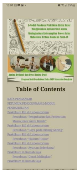
Figure 2a. E-module display with smartphone

questionnaires, and evaluating e-modules by experts. The e-module on basic physics practicum was created using the SIGIL application version 1.7.0 with the epub 2.0 extension which can be opened using the Moon+reader application on a smartphone and Radium on a laptop or computer. Here is how it looks using smartphones and laptops.