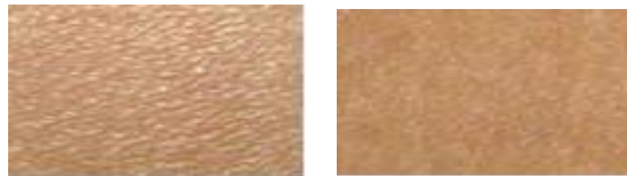
Figure 1 (a). Cropping Normal Skin 291x231 Pixels (b). Resize Normal Skin 300x300 Pixels

Proposed method starts with the conversion of the input RGB image into a single component grayscale image to reduce the computation cost because the color image consists of Red, Green and Red components. Extract the information from the raw data that is most relevant for discrimination between the classes. Extract features with low within-class variability and high between class variability. Discard redundant information. First order statistics (information related to the gray level distribution) on histogram (texture) features. Second order statistics (information related to spatial/relative distribution of gray level), i.e. second order histogram, co-occurrence matrix. The grayscale image is converted into a histogram equalized image, to make the image's intensity levels equal to get a high contrast image. The image is expressed as a matrix, the size assumed to be M \times N pixels, each pixel encoded 8 bits or 256 gray levels in Figure 1a, 1b.