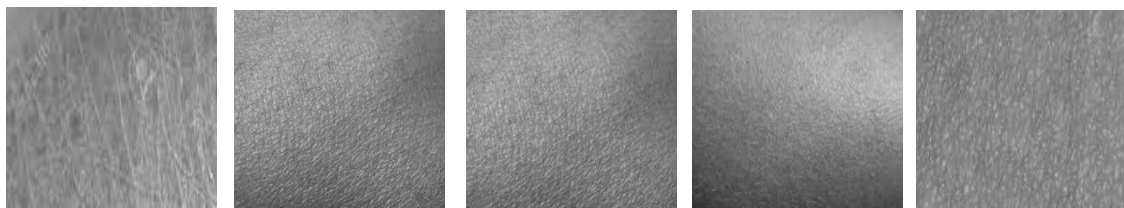
Figure 3. Cropped, Resize and Grayscale Testing Image Result

Taken testing data and stored in a database image results in the database later will be compared with the reference image so that the image obtained close to the skin classification on Figure 3.