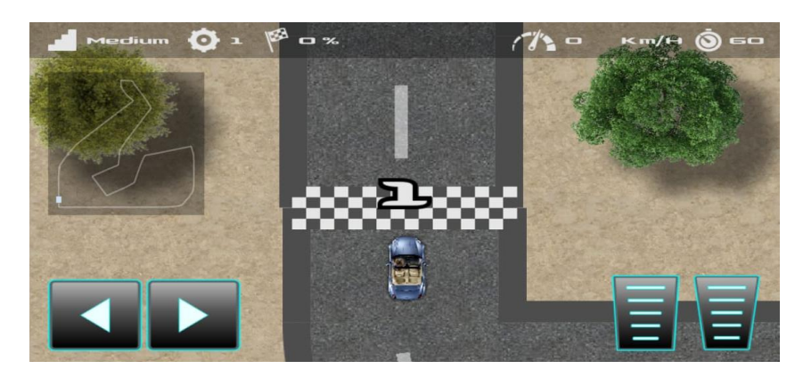
Figure 3. Medium Gameplay

In Figure 2 you can see the results of making an easy level race track where the path is made to have a slight bend angle with an easy difficulty level so that players can easily complete this mode, the game in this mode it uses a maximum population configuration of 200, a maximum generation of 500, a mutation rate of 0.03f, a path length of 80, a path length per step of 1000, a min distance of 40, a min distance. between points 1100, maximum turns of 500, diversity of turns 150, time 60.