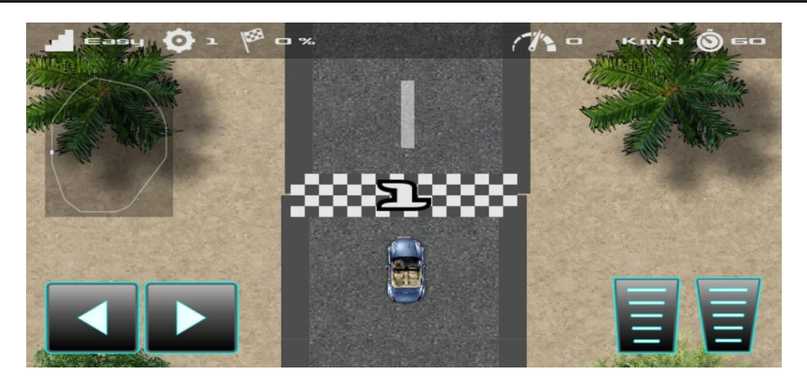
Figure 2. Easy Gameplay

In Figure 2 you can see the results of making an easy level race track where the path is made to have a slight bend angle with an easy difficulty level so that players can easily complete this mode, the game in this mode it uses a maximum population configuration of 200, a maximum generation of 500, a mutation rate of 0.03f, a path length of 80, a path length per step of 1000, a min distance of 40, a min distance. between points 1100, maximum turns of 500, diversity of turns 150, time 60.