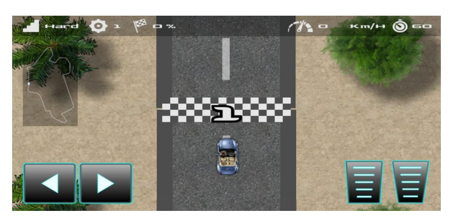
Figure 4. Hard Gameplay

In Figure 3, you can see the results of making a medium level race track where the line is made to have a bend angle with a moderate difficulty level so that players will experience medium difficulty in this mode, namely the game in this mode uses a maximum population configuration of 200, a maximum generation of 500, mutation rate 0.03f, path length 80, path length per step 1000, min distance 40, min distance between points 1100, max turn 1000, turn diversity 150, time 60.